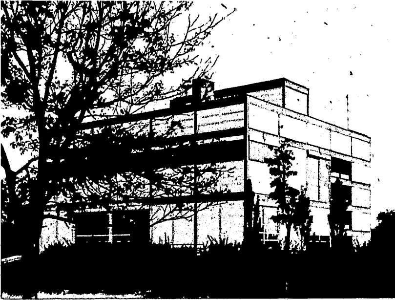
The European Youth Centre

These institutions were, however, created for the benefit of youth. The Committee for Out-of-School Education and Cultural Development has agreed that there remains a need to revive an intergovernmental programme in this area, in order to develop opportunities for dialogue between governments and youth organisations. It is believed, moreover, that an information service is needed to provide permanent contact between young