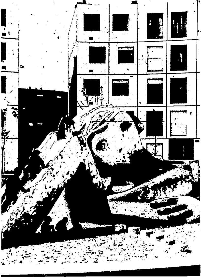
Cultural policy and the needs of the individual.